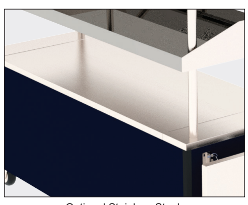
Optional Stainless Steel Removable Cover