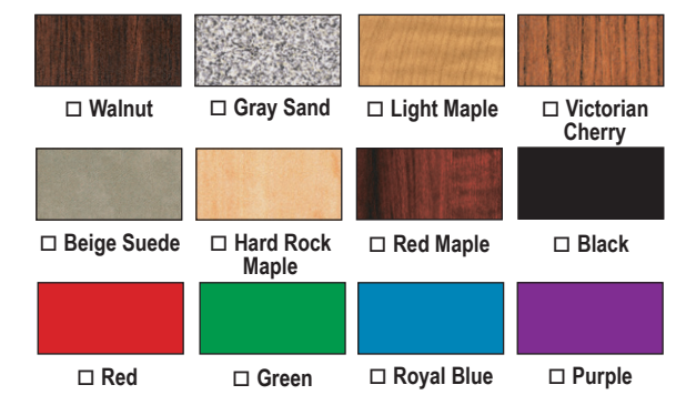
Other Plastic Laminate Finishes Available

MULTITERIA • 4900 W. ELECTRIC AVENUE • WEST MILWUAKEE, WI 53219