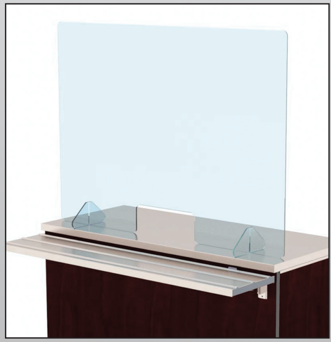
Model MAB-4724 (flat counter top application)

SAFE-SHIELD Modular Serving Shields are the easy solution to provide additional protection needed for serving lines of all types. They can convert both existing food guards and flat counters, to provide safer food serving for servers and patrons. Shields include integrated stands, so no installation is required - just set them on counters or on top of food guards.